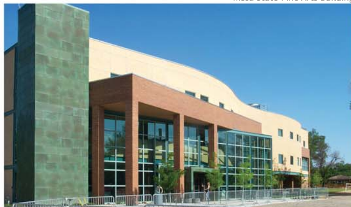
Mesa State Fine Arts Building