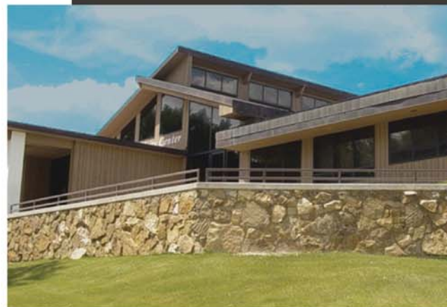
Weiss Activity Center