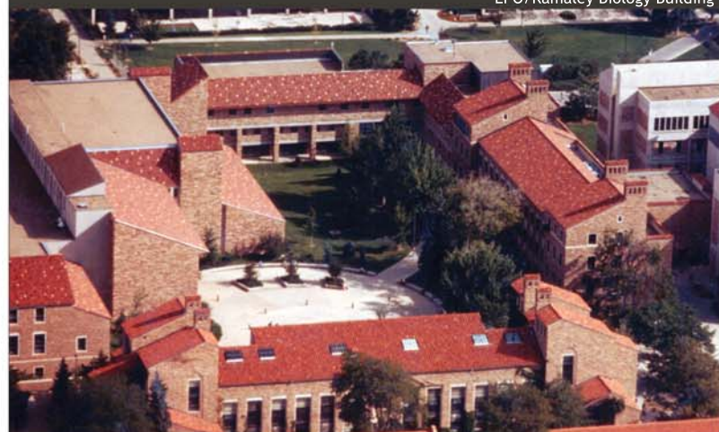
EPO/Ramaley Biology Building