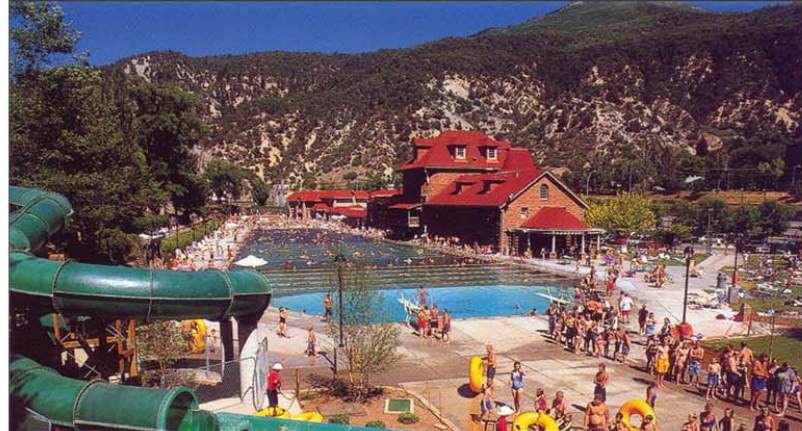
Glenwood Springs Hot Springs Lodge, Pools, & Spa