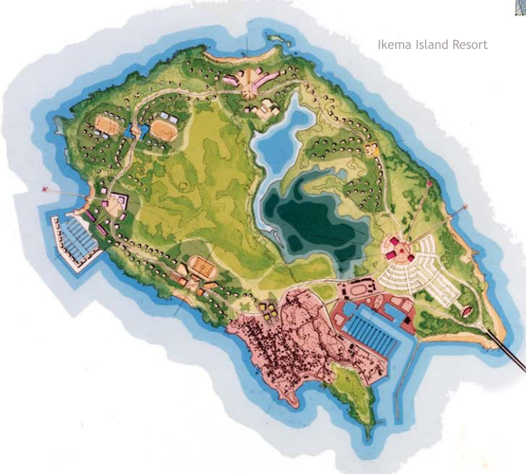
Ikema Island Resort